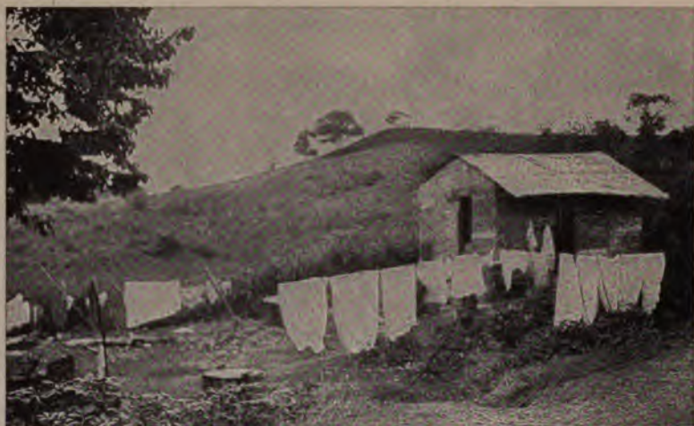
"Any hut might be a hiding-place"